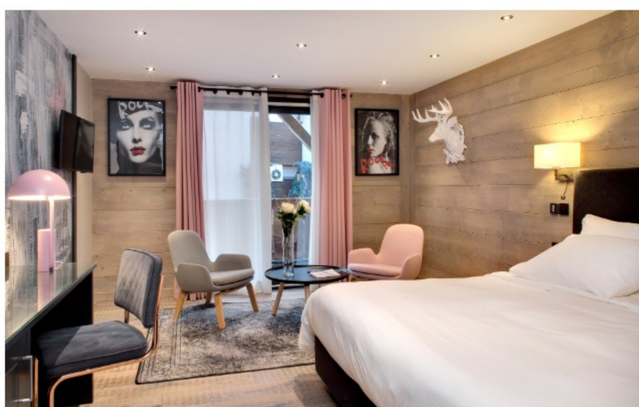
Les Gets has good selection of places to stay